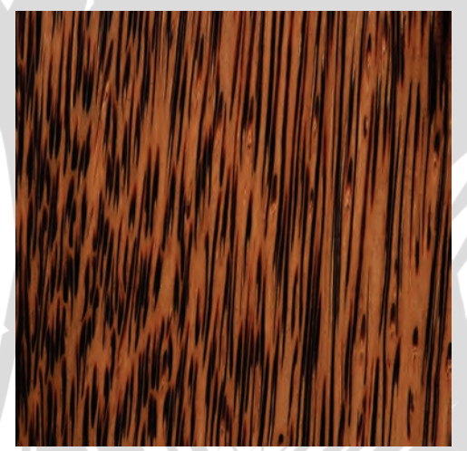
PB-3696UPN-NAF Flat Grain 3-Ply Coconut