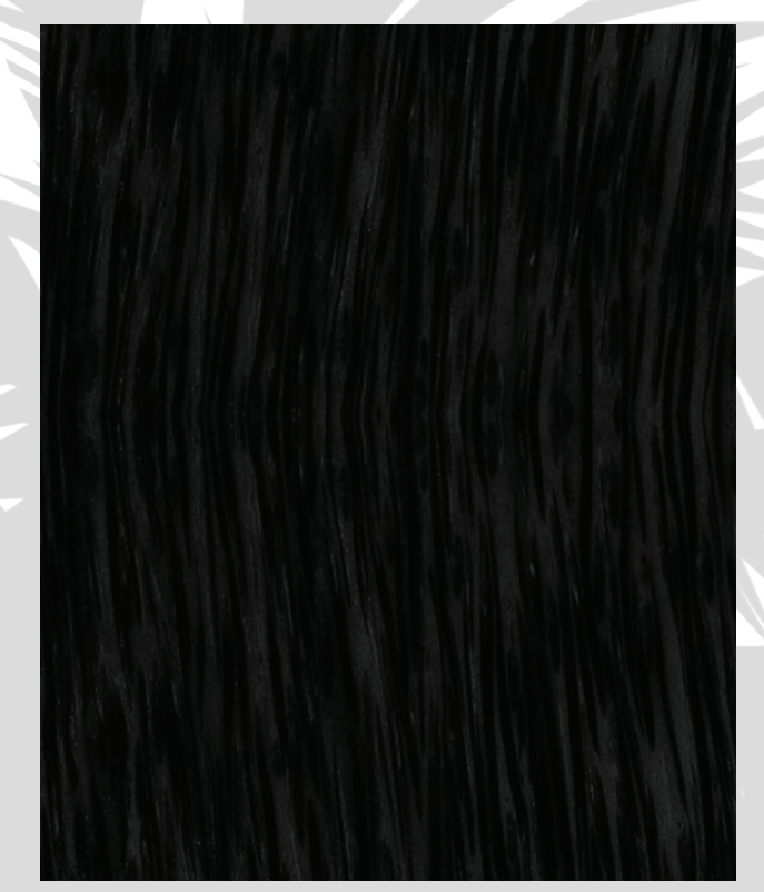
FL-5872PPE-NAF Prefinished, Coconut Ebony Stained Flat