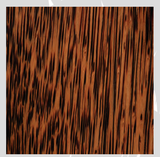
BPN-4896UPN-NAF Unfinished, Coconut Flat Grain Veneer