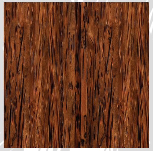
BPN-V4896UPN-NAF Unfinished, Coconut Edge Grain Veneer