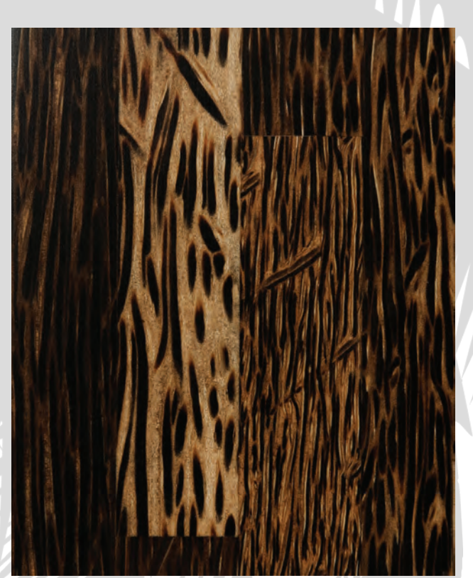
FL-V5872PPN-SG-NAF Prefinished, Sugar Deco Palm