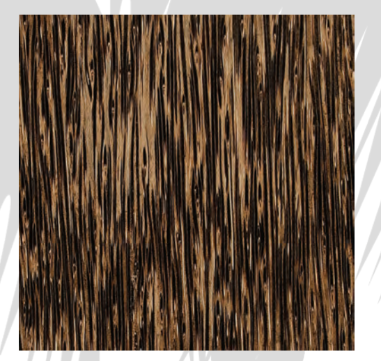
PB-3696UPN-SG-NAF Flat Grain 3-Ply Sugar