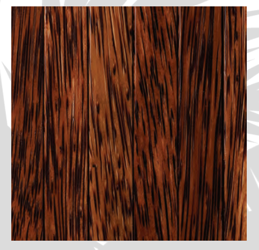
TP-4896PPN-NAF Prefinished, Coconut Palm Tambour TP-4896UPN-NAF Unfinished, Coconut Palm Tambour