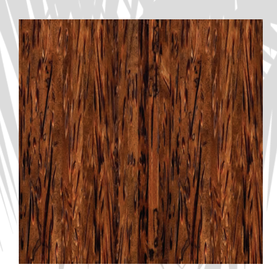
PB-V3472UPN-NAF Edge Grain 3-Ply Coconut