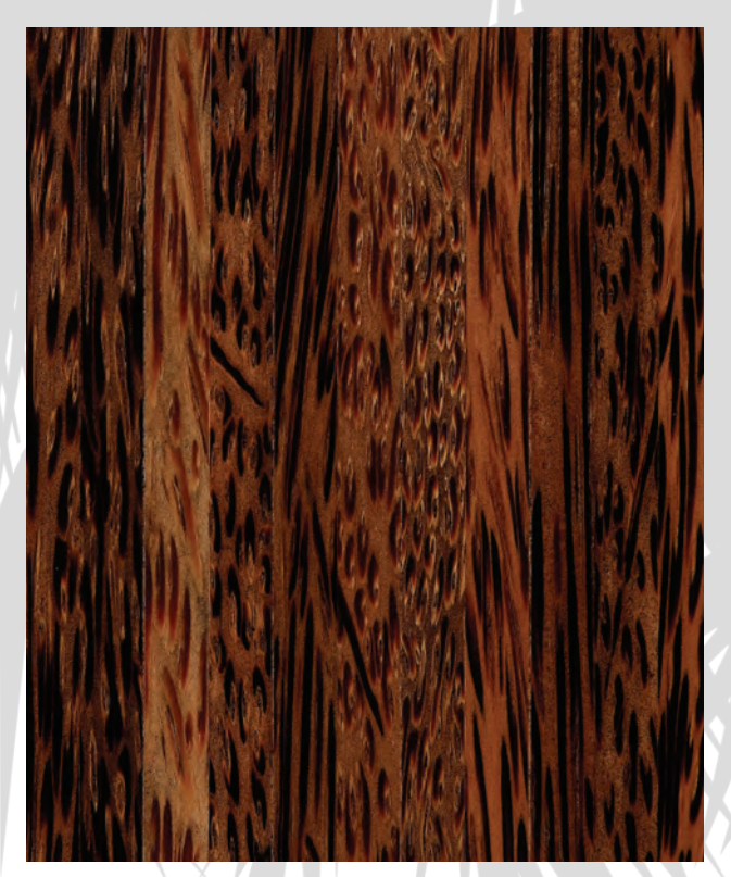
FL-V5872PPN-NAF Prefinished, Coconut Edge Grain