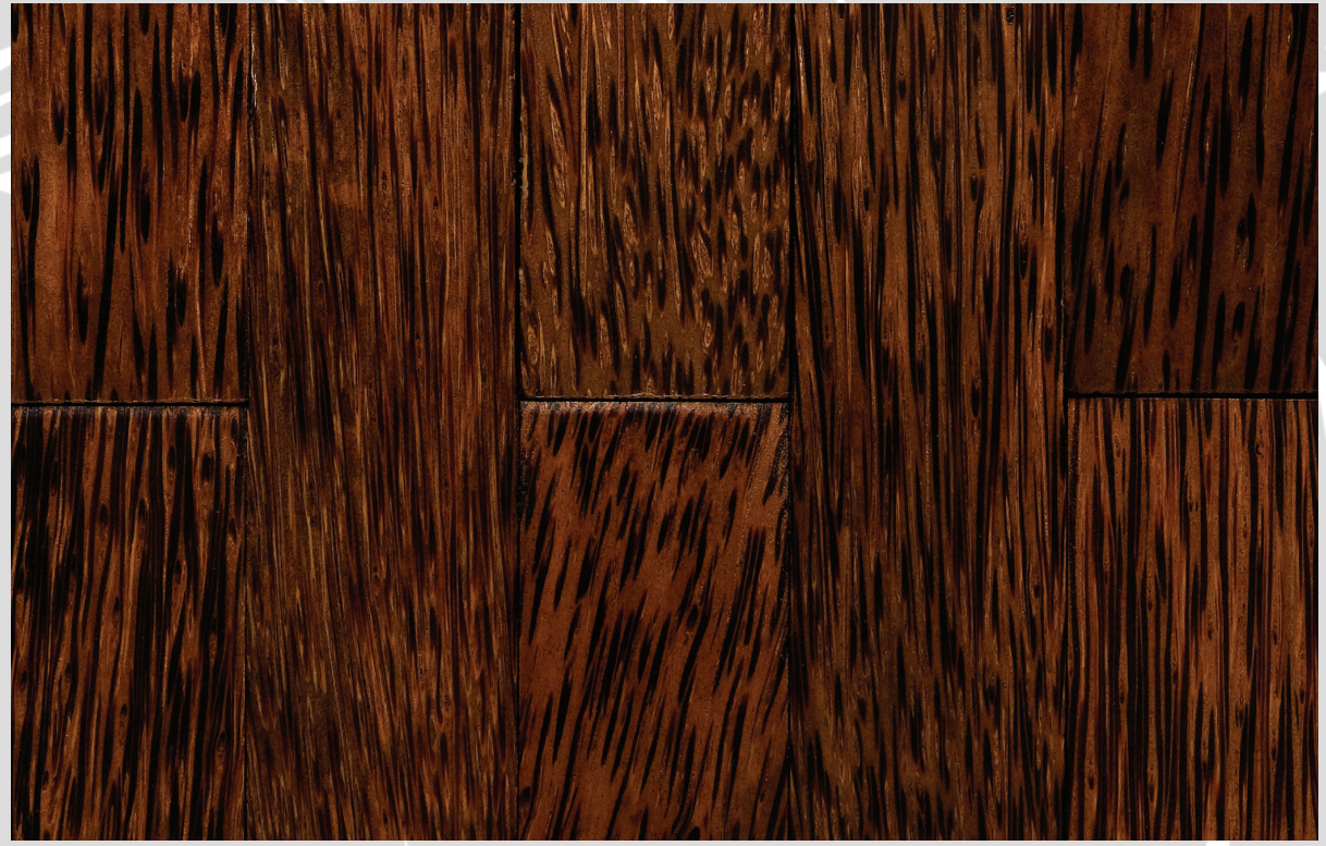
WP-648PPN Coconut, Palm Woven Paneling

Slotted at the ends with overlap seams along the lengths, this traditional woven pattern panel can be assembled on wall surfaces and cabinet faces in both a horizontal or vertical orientation creating a seamless surface of any size or dimension, installs with ease.