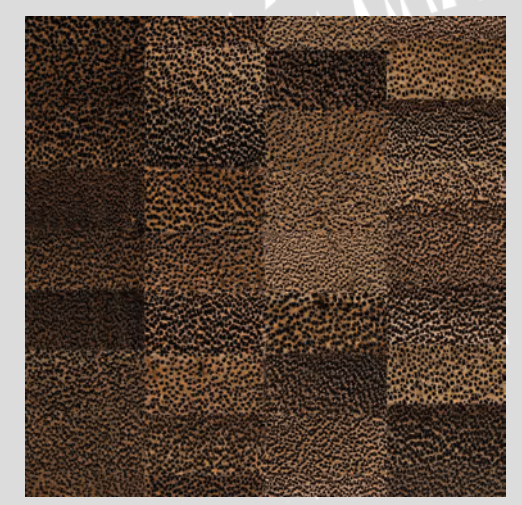
PB-EG3472UPN-SG-NAF End Grain 5-Ply Sugar Also available in coconut palm