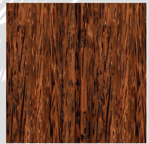
PB-V11296UPN-NAF Edge Grain Single-Ply Coconut