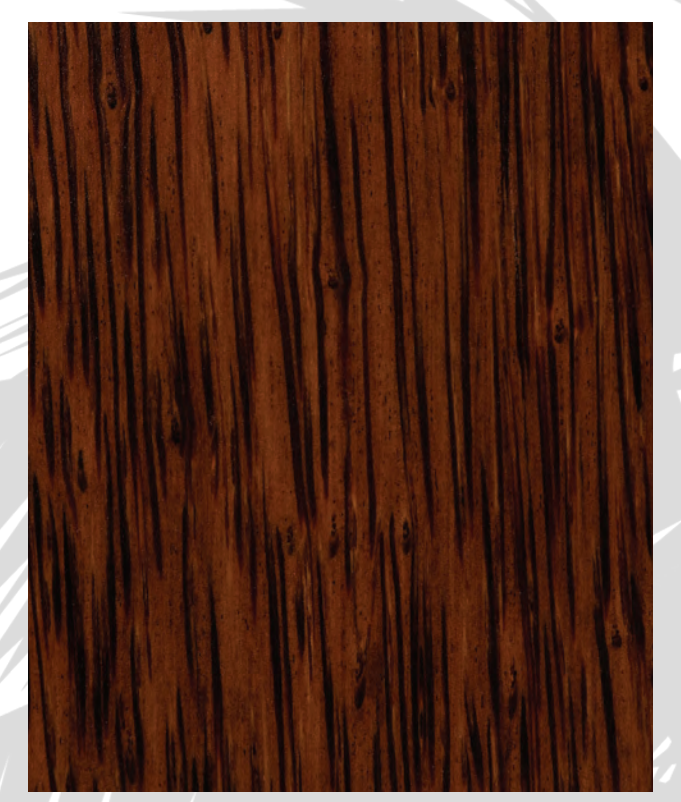
FL-5872PPN-NAF Prefinished, Coconut Flat Grain